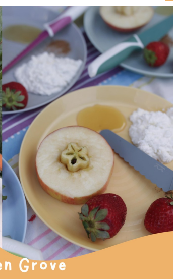
27th February 2026