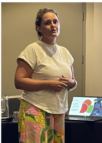
Rotary The Entrance