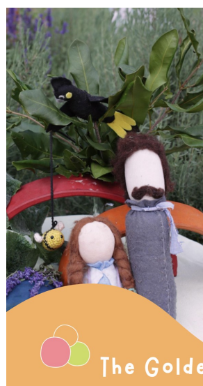
The Pelican News