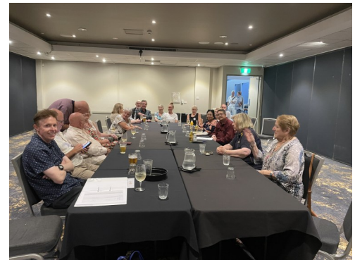
The full list of winners can be found on our webpage and facebook page.