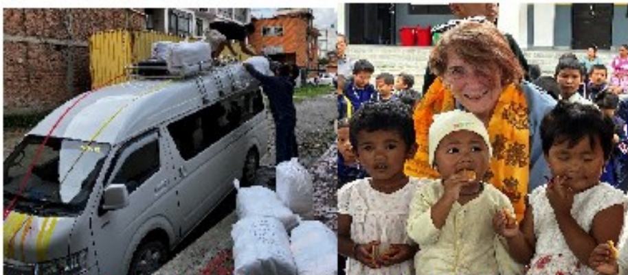
Loading up for a trip to Sindhuli