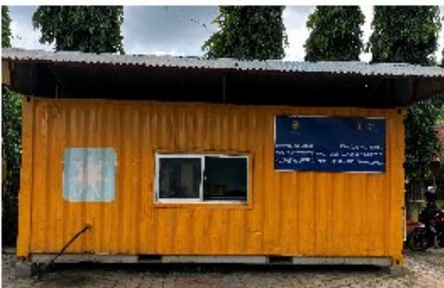
Container Canteen built for Shree Kalika School

All donations are Tax Deductible by authority of the "Rotary Australia Overseas Aid Fund" (ABN 21 388 376 554) and this project is endorsed as a Deductible Gift Recipient by the ATO.