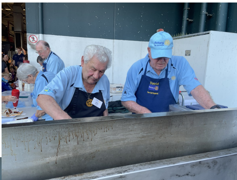
Hard at work at the Bunnings Halloween Night