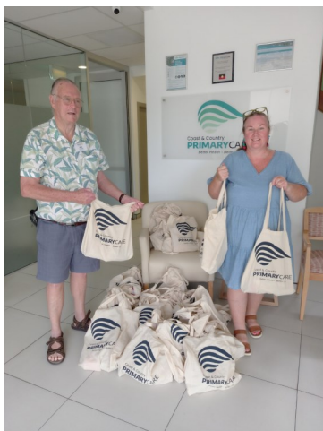
Rotary The Entrance