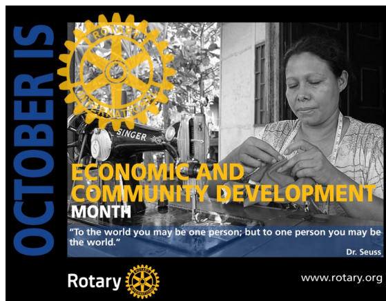
The Pelican News 25th October 2023