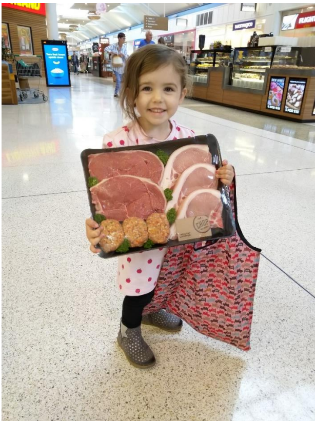
One of our happy winners at spin & Win in September. Meat Tray courtesy of Chop the butchers at Bateau Bay square

If anyone finds they cannot make a particular day try to organise a swap with a member doing the following SAW & give Clive as much notice as possible.