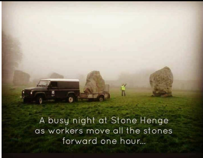
A busy night at Stone Henge as workers move all the stones forward one hour...